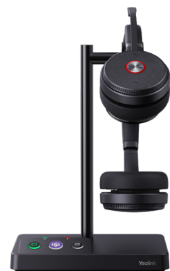
WH62 Dual Teams WH62 Dual UC

Based on hundreds of headform evaluations and thousands of wearing comfort tests, WH62 well meets the ergonomic requirements. Besides, with premier soft leather cushions and lightweight design, you can wear it all day comfortably. For more workspace freedom, WH62 can also free you up to 160m away from the desk.